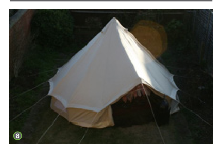
▲ 8. Once all the pegs are in, adjust the guy ropes to create the desired tension.

By doing it this way, and following the seam lines, your PRO Tent will look like this: perfect and without creases.