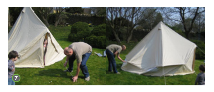
▲ 7. Zip the door shut and attach the first guy rope above the door using the large pegs. Then attach the rest of the guy ropes around the whole tent without putting any of them under too much tension.